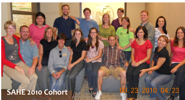
SAHE 2010 Cohort

"Through the incredible SAHE alumni network, I was able to secure a summer practicum with Academic Impressions in Denver, affording me an experience like no other. AI supports professional development in higher education through webinars and multi-day live conferences. I was charged with conducting research on various topics – study abroad, student health insurance, international programs, and library/IT services – and creating proposals for web conferences with the potential to be viewed by hundreds of student affairs professionals. Imagine a class where the professor tells you to pick a topic and call 60 professionals from across the country to ask them what their college is doing in this area. Your knowledge would increase tenfold, right?! Well, this is what I did all summer and hearing the perspectives of professionals at other institutions definitely helped paint a broader picture of higher education for me. I even realized the value of my SAHE education as several people I spoke with mentioned things we had talked about in class – in loco parentis and Why Are All the Black Kids Sitting Together in the Cafeteria? , for example. (If you don't know what those are, you definitely will by the end of your first year!) Overall, I am thankful that SAHE provides the freedom and flexibility to choose a practicum experience in support of one's career goals, knowing one doesn't have to work in a collegiate setting to be a contributing member in the world of student affairs."