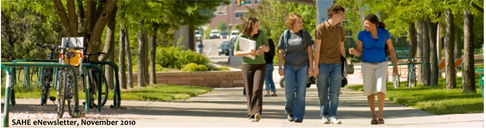
SAHE eNewsletter, November 2010