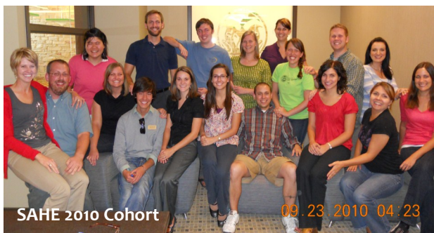
SAHE 2010 Cohort