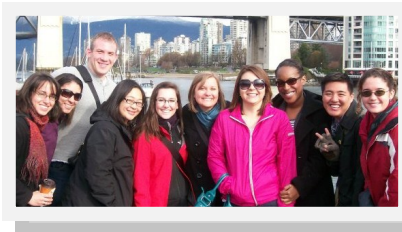
SAHE Students in Canada for International Field Experience