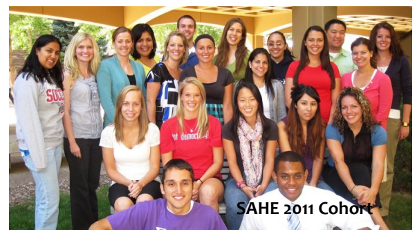
SAHE 2011 Cohort